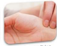
Alternative medicine, beauty & well-being