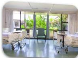
Hospitals and senior residences