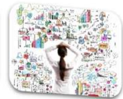
Medical communications & advertising