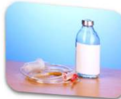
Clinical nutrition, food & dietary products