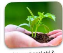
International aid & non-profit organizations