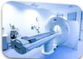
Medical capital equipment & imaging technology