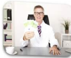
Health insurance & health care finance