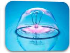
Health tourism, spa & medical travel