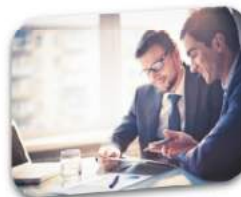
Health care consulting industry