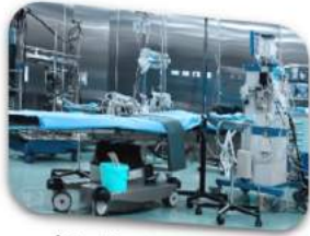
Medical devices & dental

We offer client project execution by a direct search approach from candidate identification to placement. Furthermore, we include a number of additional factors linked to the value chain of our client, such as client's time, client's costs, client's HR resources as well as cultural and ethical aspects.