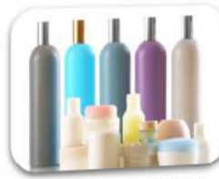
Cosmetics, perfumes & FMCG