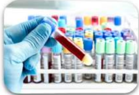
Medical diagnostics, laboratory & testing