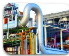
Chemicals, fine chemicals & specialty chemicals