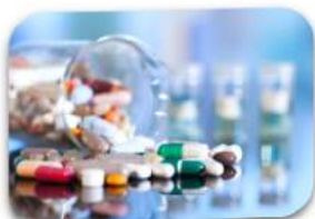
Pharma & generics