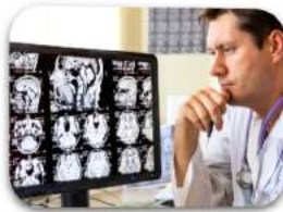
Health care IT, digital health & medical informatics