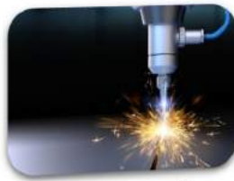
Medical automation, general engineering & OEM