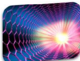
Micro & nanotechnology, material sciences